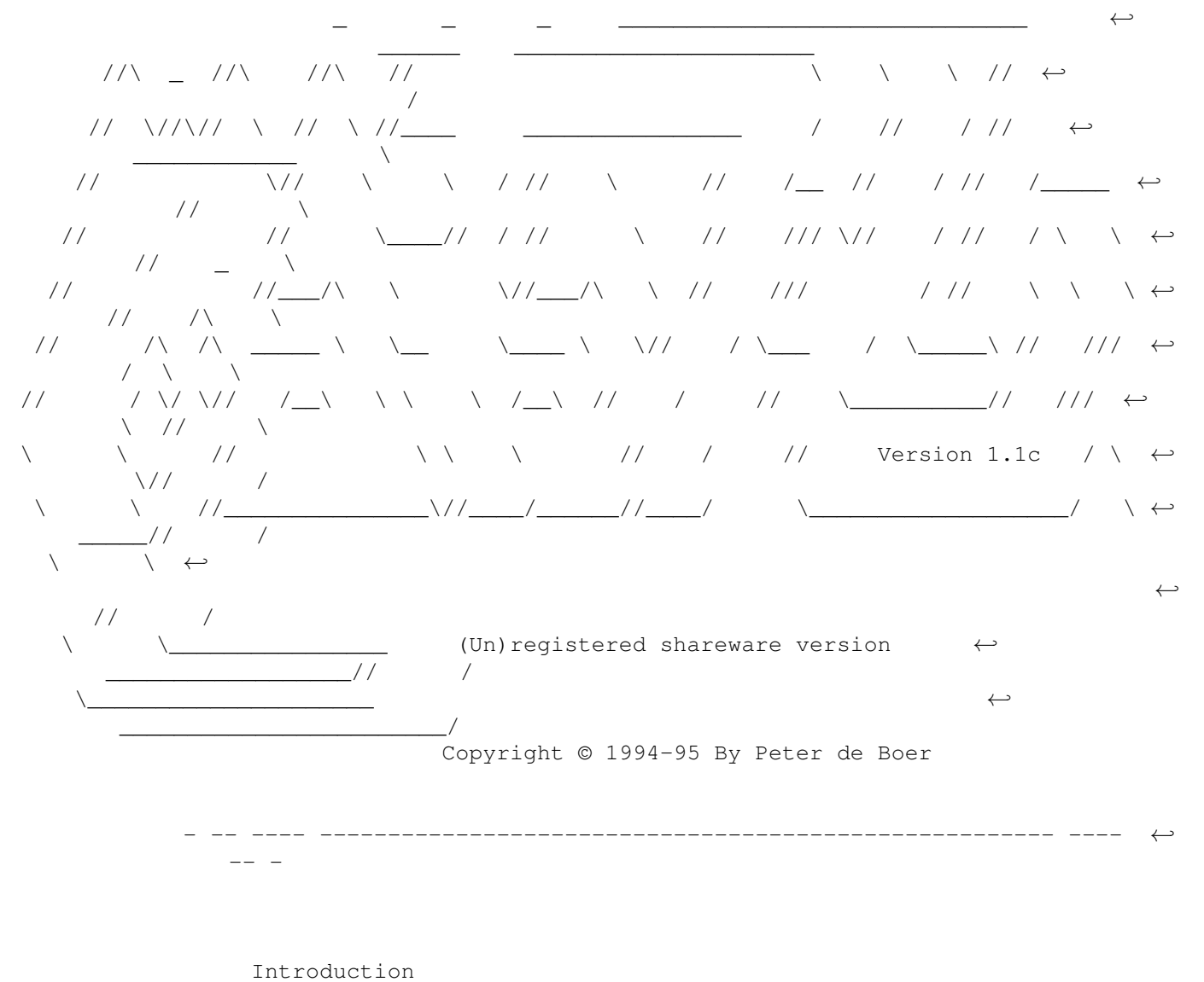
What is it anyway